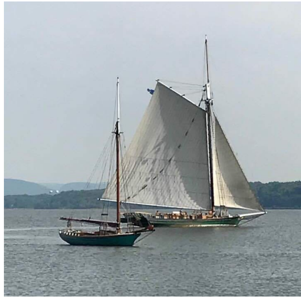
(Posted on Facebook 6/19/18) (Photo cropped for inclusion in newsletter.)