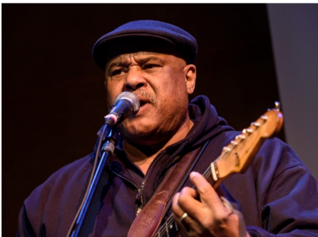
Bounce-back Reggae Band