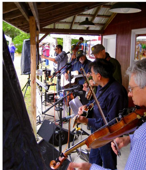
3 Quarter North

A family-friendly event with live music and rare video of Pete Seeger performing with kids. Proceeds to support North River Friends of Clearwater's effort to provide educational sails aboard The Sloop Clearwater to local school groups.