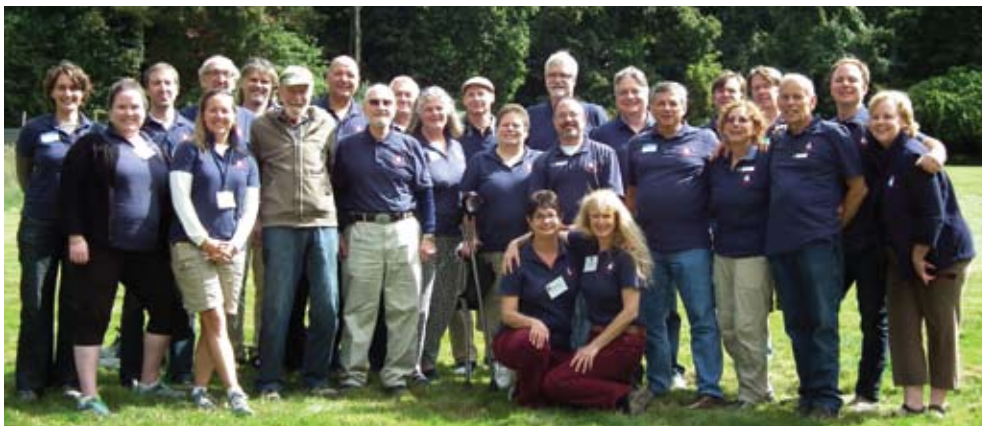
At left: The 2013-2014 Clearwater Board pictured here with staff and our celebrated founder, Pete Seeger, at the 2013 Annual Meeting.

His vision for working with Clearwater is to build a sizable endowment fund that will provide Clearwater ample financial resources. With greater resources, Clearwater will have the capacity to reach out to more and more people, young and old, in a multitude of new and innovative ways.