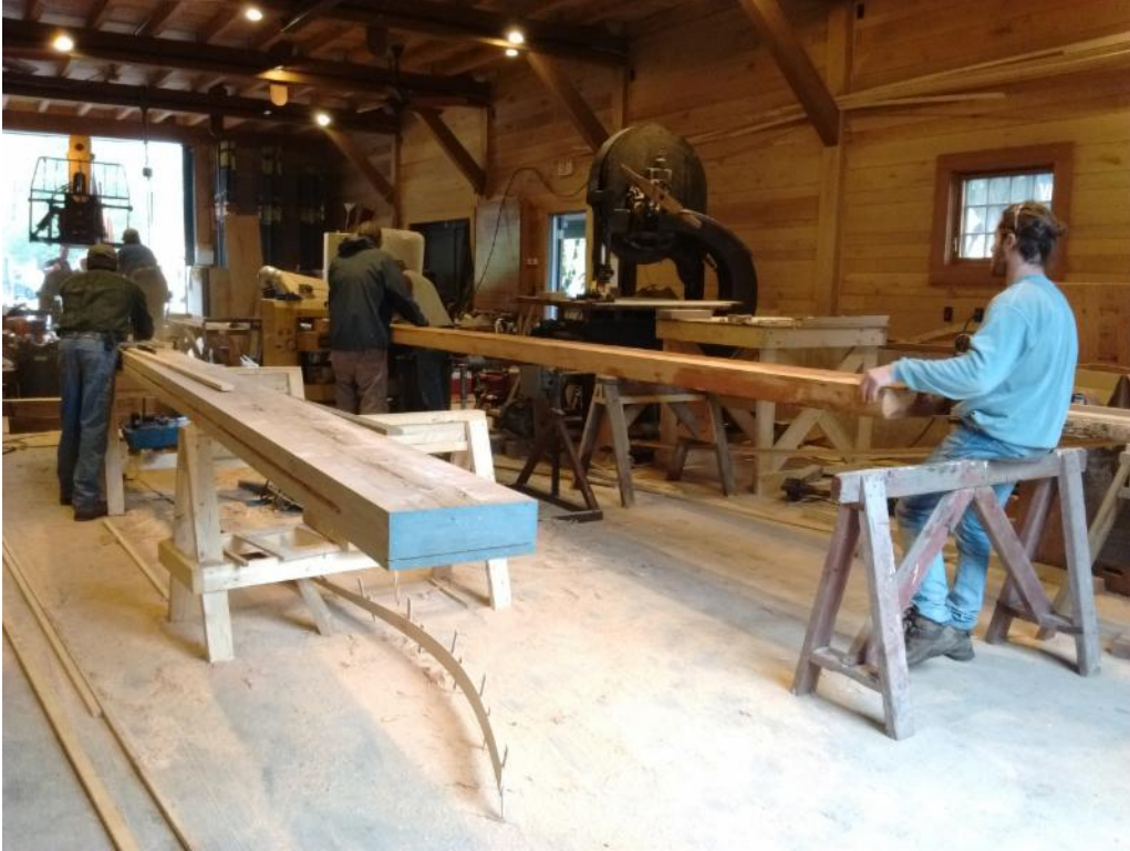
Two of the trunk planks are being shaped.