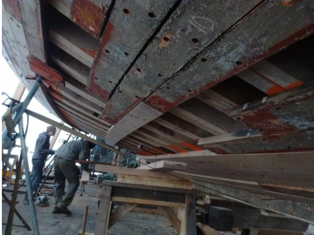
Working to fill in the starboard hull.