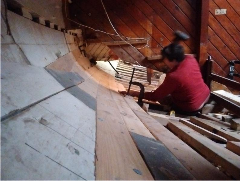
View of the port side ceiling and stringers from the main cabin looking forward.