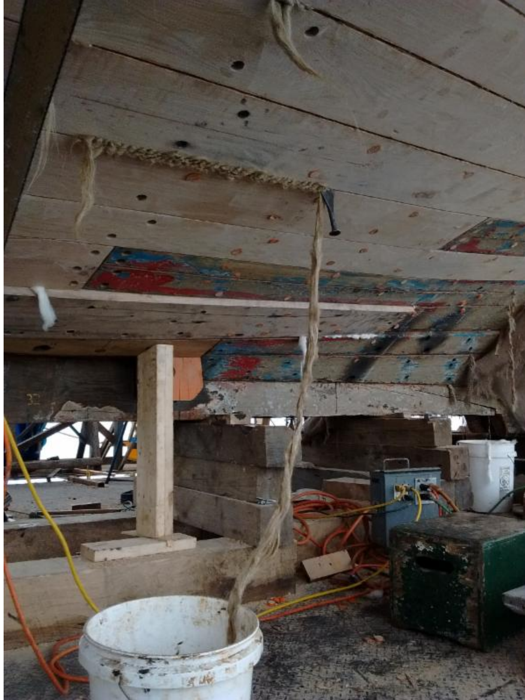
Oakum and a caulking iron.