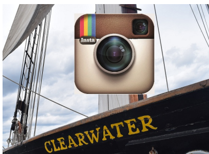
Follow the restoration live on Instagram!