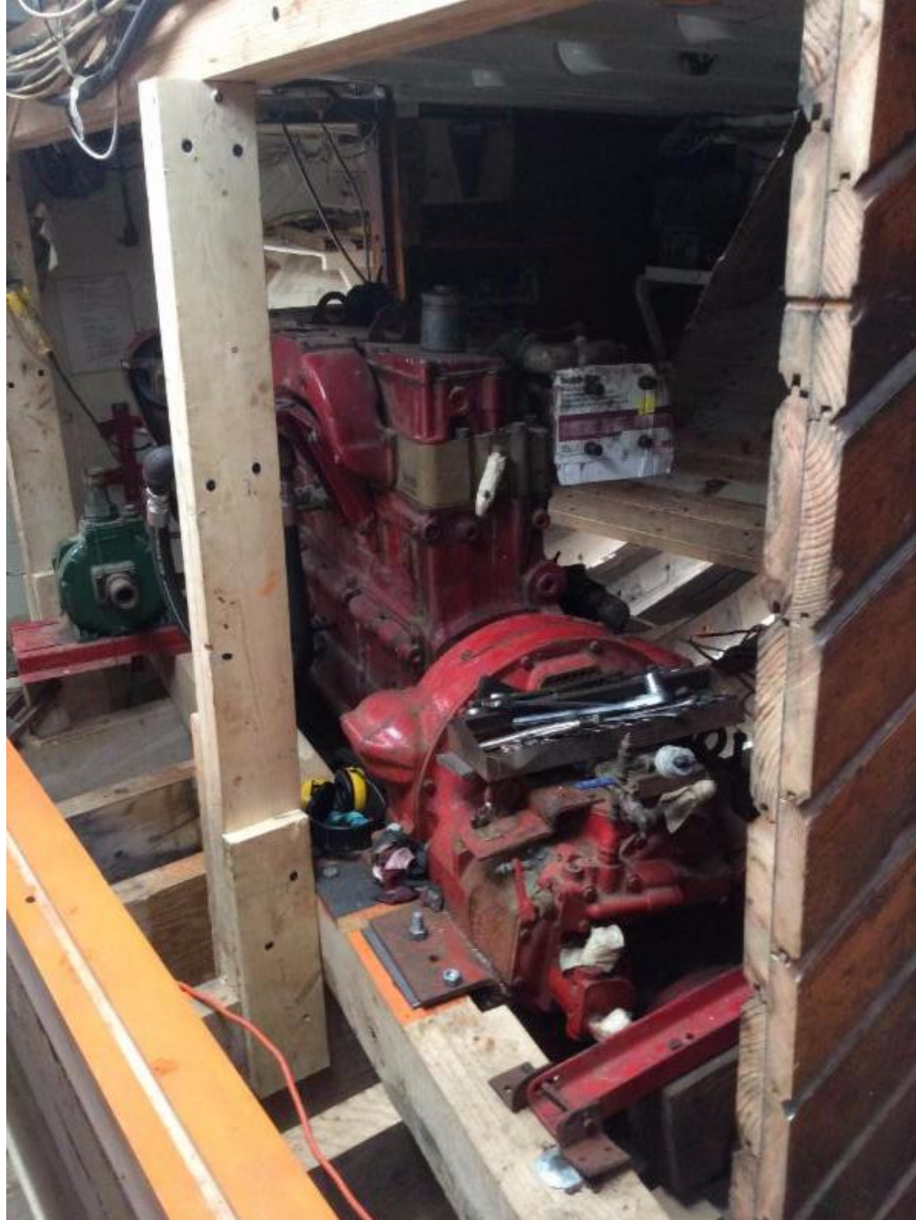
The engine is lowered on its new supports.