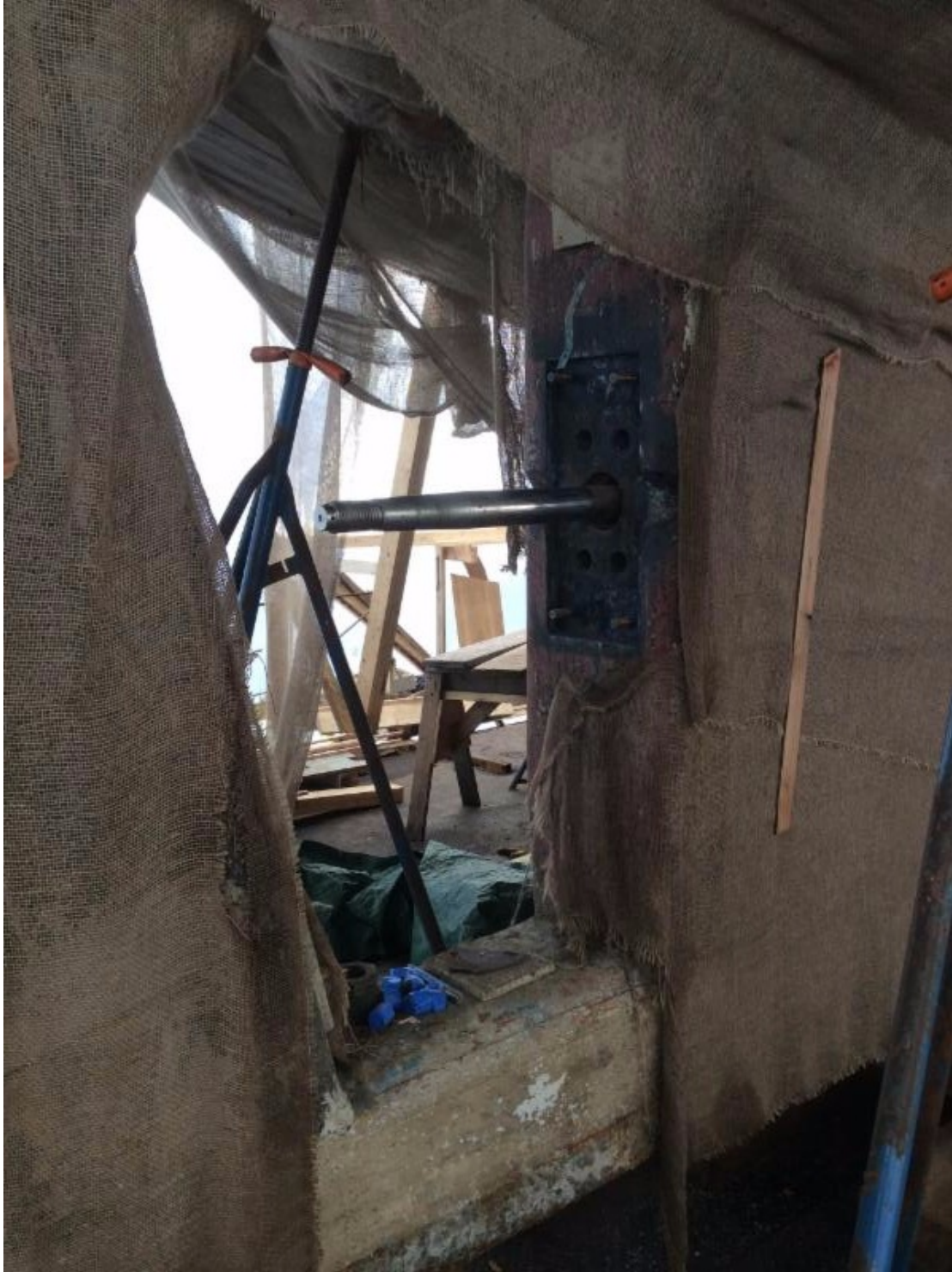
Do you see what's missing? The propeller has gone away for routine maintenance.