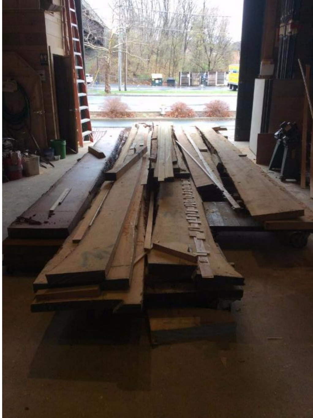
We've got plenty of plank stock ready to go!