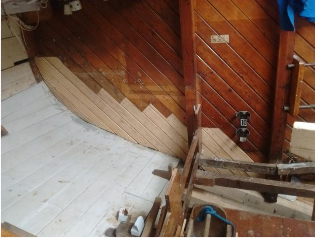
Here's a finished section of the bulkhead.