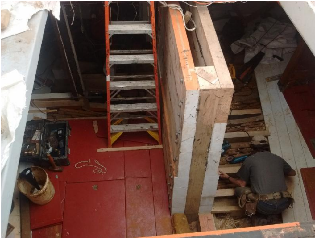
Supports being fit on the port side.