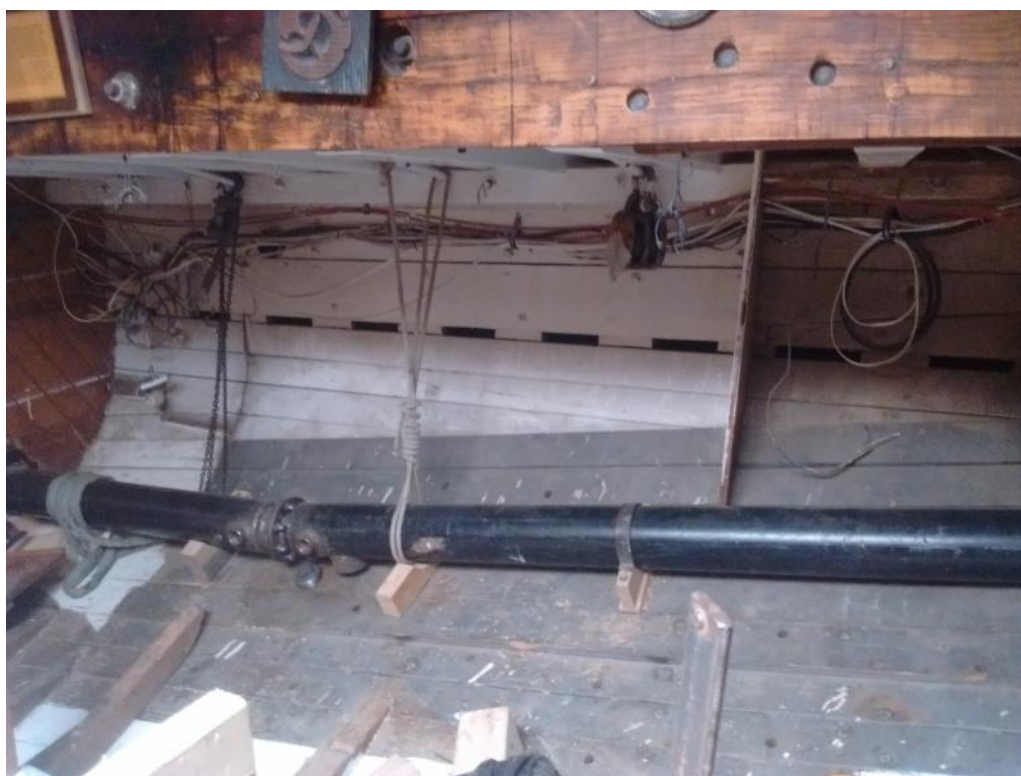
Here's the exhaust in place.