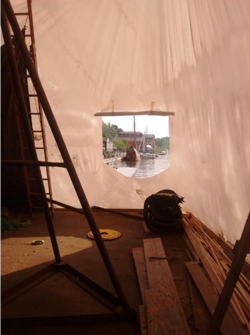
A view from the newly cut window.