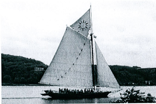
Tom Staudter / Clearwater