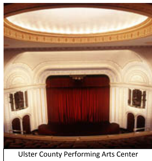
Ulster County Performing Arts Center

The arts are well integrated with other sectors of our business economy: