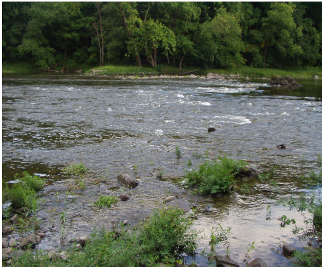
Site RN15, Creeklocks Road September 15, 2007, 5 p.m.

following day after the high waters had subsided. The difference in flow in that 16-hour period is significant.