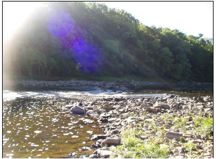
Site RN15, Creeklocks Road September 16, 2007, 9 a.m.

The old Delaware and Hudson Canal channel connects to Sandburg Creek upstream of the Village of Ellenville and the Honors Haven Resort. It did not exert any noticeable effect on water quality. The macroinvertebrate community was “non-impacted” at the Honors Haven resort in 2009 and “slightly impacted” (but close to “non-impacted”) in 2010.