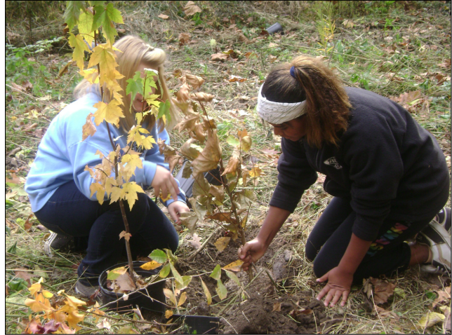
6.1.2 DEC's Trees for Tribes program helps connect community members with watershed restoration efforts in Rosendale, NY.