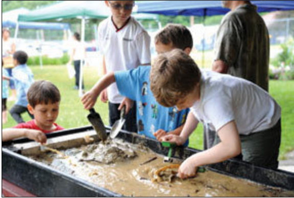
Photo 6.2.2 Children playing at stream morphology table – Rosendale Earth Expo.2010.

Create public access maps of the Rondout Creek that are easily read and straightforward. Hardcopies should be available in addition to making them available on the internet. The maps should also include recreational assets and watershed delineation. People with professional training in watershed management should create the maps in collaboration with Ulster County Tourism and each municipality. Communication between stakeholders (landowners, citizens), and policy makers (town boards, CAC's, non profits) should be improved to foster cooperation through the use of town hall meetings. In order to promote awareness Service Learning Projects such as water monitoring, habitat restoration, and removal of invasive species, by volunteers with write ups of each