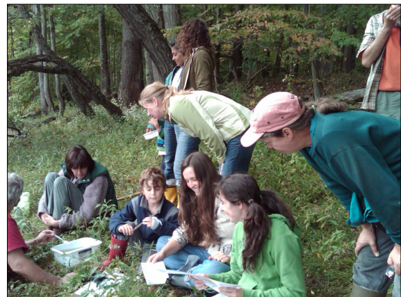
Photo 6.1.3 Families learn how to measure the health of their creeks at the Stream Monitoring Day hosted by RCWC at Camp Epworth in High Falls, NY.