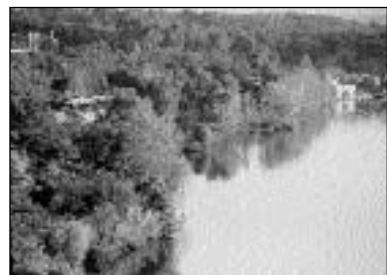
Poughkeepsie Southern Waterfront